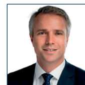
Stuart Welch Healthcare, Transport, Infrastructure and Building Materials