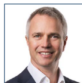
Stuart Welch Healthcare, Transport, Infrastructure and Building Materials